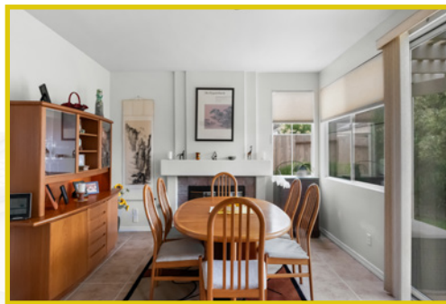
Family Room w/Fireplace