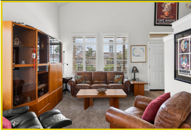
Living Room w/Vaulted Ceiling