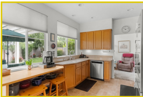
Kitchen Faces Back Yard

Property Features Include; Welcoming Front Porch With Double Front Door Entrance Into Impressive Tiled Foyer With Soaring Overhead Ceiling And Modern Hanging Chandelier. Comfortable Living Room With Vaulted Ceiling, View Windows With Plantation Shutters, Ceiling Fan/Light, Attractive Light Tone Paint Design With Accent Baseboards And Natural Beige Tone Carpet Flooring. Beautiful Kitchen With Premium Grade Quartz Counter Tops, Decorative Tile Back Splash, Venetian Style 18" Floor Tile, Custom Made Breakfast Bar, Handsome Wood Style Cabinetry, Food Pantry Closet, Recessed Lighting, Quality Brand Stainless Steel Appliances Including GE 5-Burner Gas Stone/Oven, Back Yard Garden View Window Over Sink, Sliding Door Access To Back Yard Patio And Dining Area With Modern Overhead Ceiling Fan/Light & Elegant Tiled Fireplace. Lovely Relaxing Bedrooms On Upper Level Including Larger Master Suite With Double Door Entry, Vaulted Ceiling With Premium Light/Fan, Attractive Light Tone Paint Design, View Windows With Plantation Shutters, Natural Tone Beige Carpet Flooring And Nice Personal Bathroom That Has Arched Entry, Dual Basin Vanity, Recessed Lighting And Sliding Door Closet.